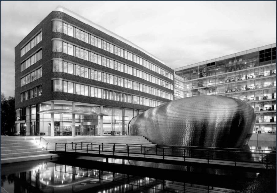
TOP: In the Research & Development laboratory, BOTTOM: Beiersdorf AG, Research Center Hamburg